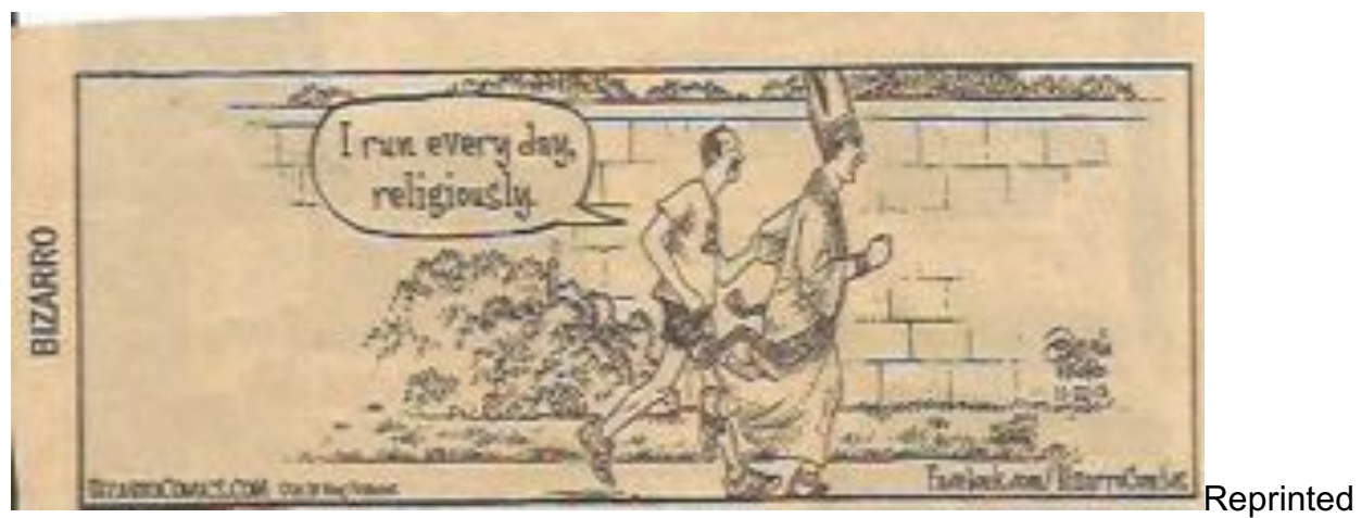
with permission from artist Dan Piraro.

"Running can help you loose weight. Running can build muscle tone. Running can improve your complexion. Running can strengthen your heart and make it work more efficiently. Running can increase your aerobic capacity and lower your blood pressure. Running can relax you, help you quit smoking, and reduce the risk of heart disease. Running can reduce depression and lift your spirits. Running can help you think and make you more creative. Running can make you more athletic and energetic and full of vitality. Running can improve your self-image and make you more self-confident. In short, running can change your entire outlook on life and make a new person of you."