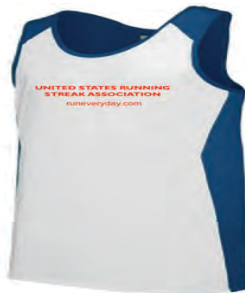
USRSA Men’s Singlet