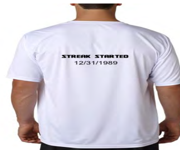
Optional “Streak Started” Date