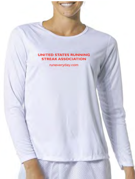
USRSA Women's Long Sleeve