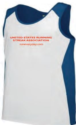
USRSA Men's Singlet