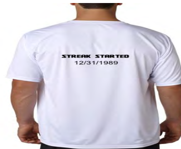
Optional “Streak Started” Date