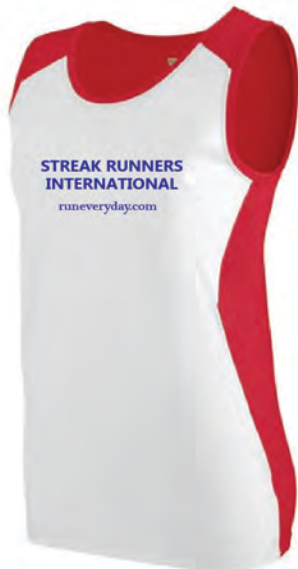
SRI Women's Singlet

Please go to http://www.clearlybranded.com/showrooms.htm and then click SRI/USRSA logo to order your singlet, short or long sleeve shirt! For an additional $5, get your “Streak Started” date printed on the back of your singlet or Shirt!