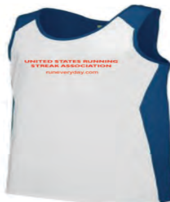
USRSA Men's Singlet