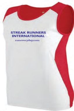
SRI Women's Singlet

Please go to http://www.clearlybranded.com/showrooms.htm and then click SRI/USRSA logo to order your singlet, pullover, short or long sleeve shirt! For an additional $5, get your “Streak Started” date printed on the back of your singlet or shirt!