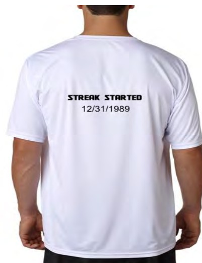
Optional "Streak Started" Date