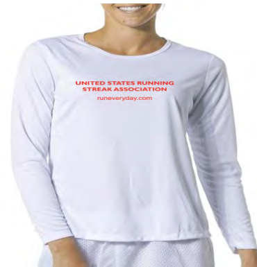
USRSA Women's Long Sleeve