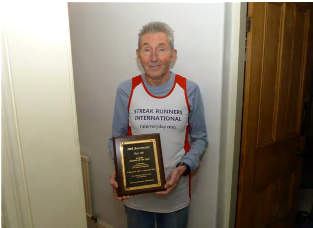
Ron Hill, who holds SRI record for longest streak and fastest half marathon.